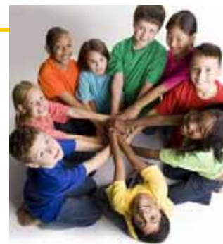
Children's Worship Center

response and little "feast". We will return the children to the sanctuary and their families during the final hymn.