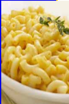
Boxed Mac & Cheese Yummmmm!

The Mission Committee wishes to thank all of you who donated mac and cheese for Project Salina. As we mentioned in worship, our goal this year was 600 boxes. The food drive ended Monday, June 1 and we collected 948 boxes. Your gifts during the coffee hour gave us a BIG BOOST. We collected $135.00 in cash and that meant 360 more boxes. Thanks to you, Sunrise Presbyterian continues to help feed hungry people in our community.